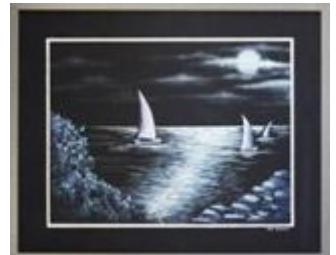
Sue Robinson-Midnight Sail acrylic