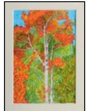
Robyn Sweet- Autumn Primaries Watercolour pencil