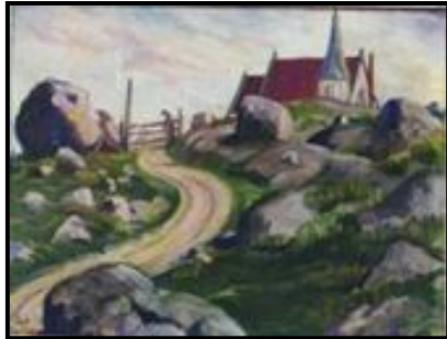
Peggy's Cove Gate- mid 1920's