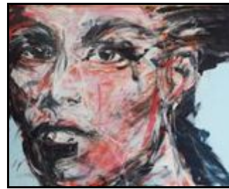
Claude Gendron Un Seul Regard A Suffit- acrylic