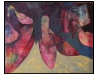
Monique Cantin The Shop On Montague- acrylic