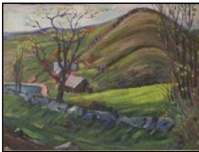
There Is A Green Hill - Mid 1950's