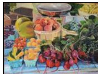
Patty Rhinelander-Market Bounty