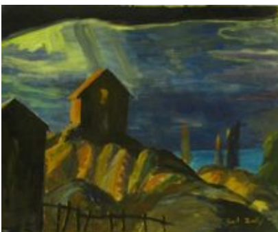
After The Storm – 1960's