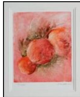
Laurel Haslett Peaches- monotype