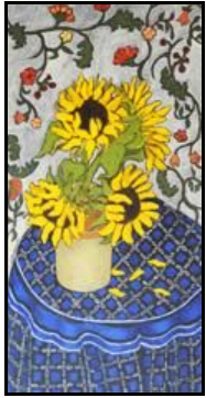
Janet Moore- Sunflowers on a Round Table