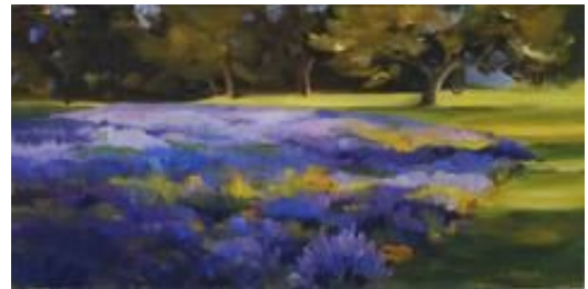
Louise Baker- Lavender Fields- oil