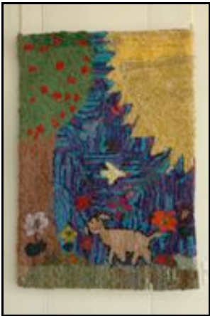
“Bad Dog Running Through The Garden”-Caroline Roellinghoff