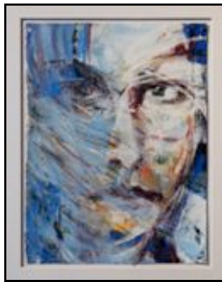
"Here Comes The Rain Again"- Claude Gendron- acrylic