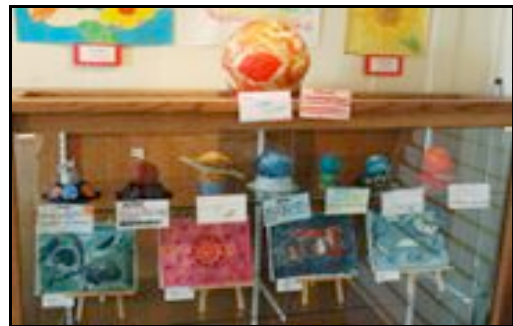
The Solar System, Grade 6, Lunenburg Academy