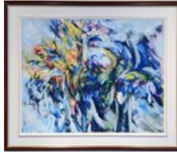
"Spring"-Wendy Truswell - acrylic