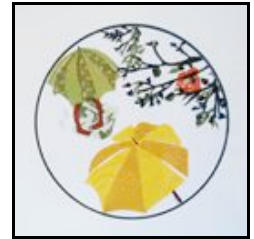
"After The Rain" Shirley Abberton-collage