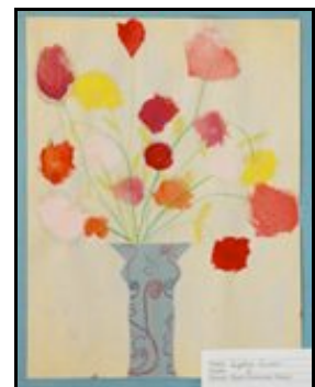
Lydia Cross Grade 5