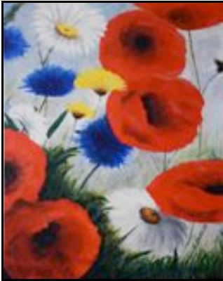
"Garden"- Carol Colby-acrylic