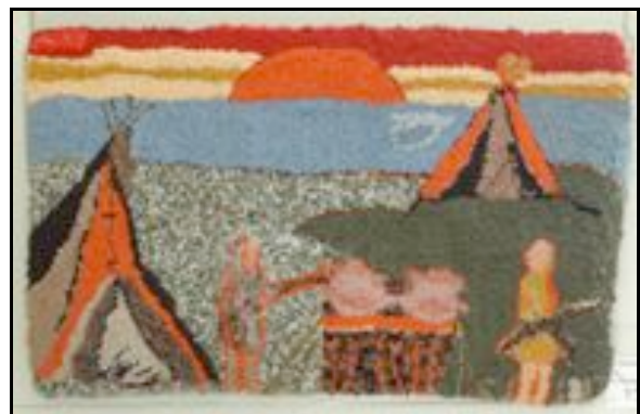
"Salmon On Fire"-Susie Vienneau - Rug Hooking