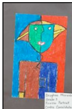
"Picasso Portrait", Broghan