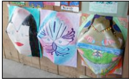
Three-D Faces- Newcombville Elementary School