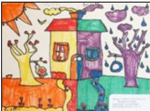
"Study in Warm/Cool Colours"-Bridget Archibald, Grade 2, Aspotogan Consolidated School