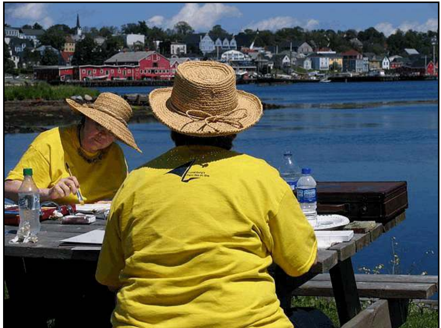
Artists at work at Paint Sea On Site

Attic Art & Collectibles Sale 10:00am - 1:00pm