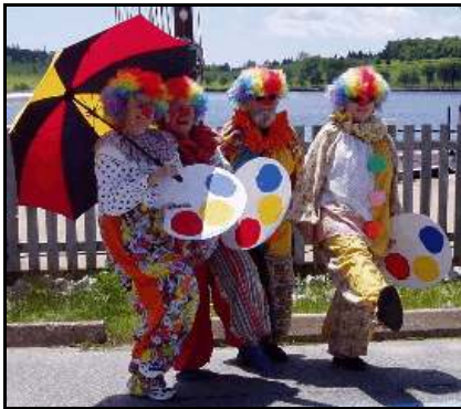
Clowning around at PSOS