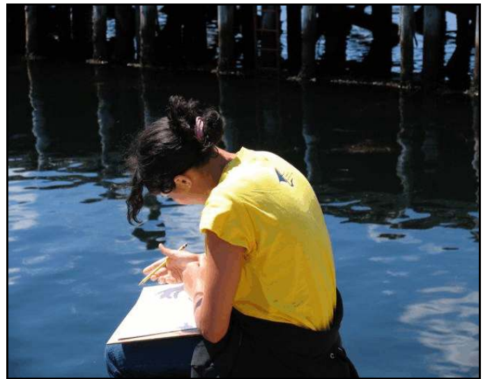
Paint Sea On Site Artist at work

Members' Library: We have publications available for any member to borrow. Please remember to sign out and in on