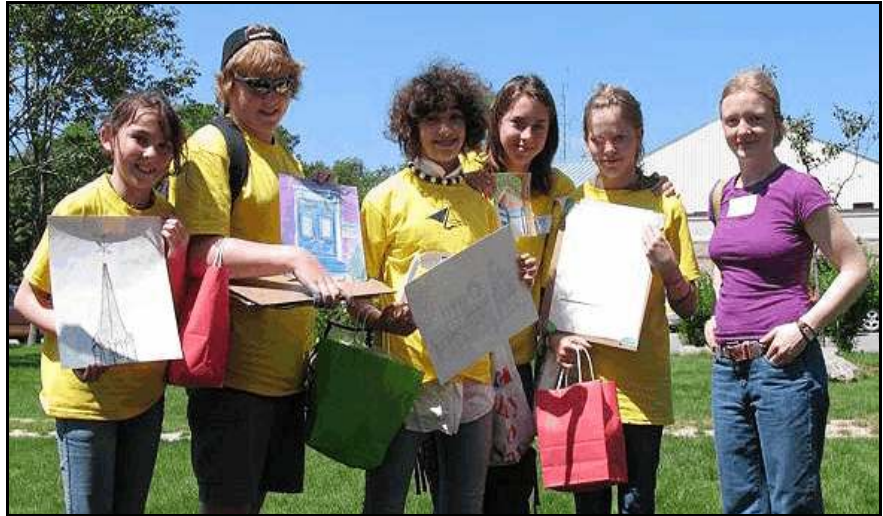
Students from Paint Sea On Site